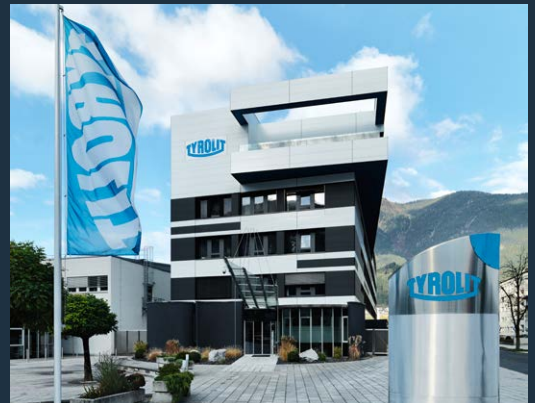
The TYROLIT headquarters in Schwaz, Austria.

Like us on Facebook facebook.com/TYROLIT